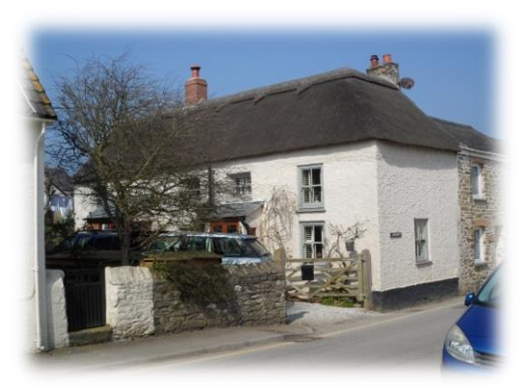
"Listed Buildings should be preserved and retained"